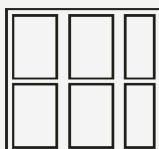
32 x 7lt + 16 x 5lt