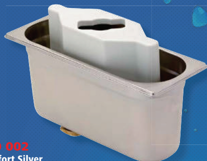
930 002 Comfort Silver

Fit-in version Water connection 3/4" + 1" LxWxH container with border approx. 325 x 132 x 150 mm LxWxH container without border approx. 300 x 107 x 150 mm