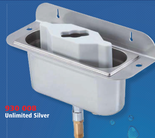
930 008 Unlimited Silver

Add-on version Water connection 3/4" + 1" LxWxH angle holder approx. 403 x 152 x 66 mm