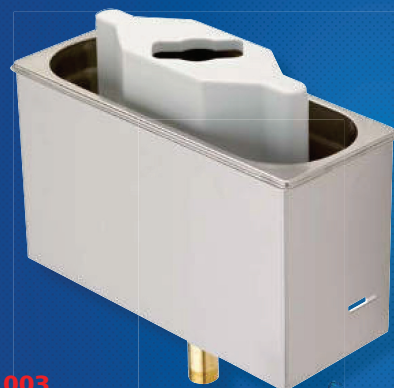
930 003 Unlimited Silver

Add-on version Water connection 3/4" + 1" LxWxH holder approx. 310 x 124 x 185 mm