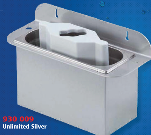
930 009 Unlimited Silver

Add-on version Water connection 3/4" + 1" LxWxH cover plate approx. 303 x 132 x 180 mm